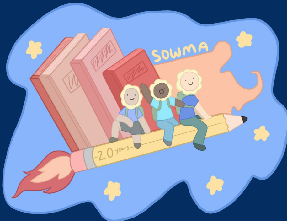
Illustration "Reach for the Stars" by Kylie Ballentine, Massachusetts College of Art & Design

Guides a student through high school, college or vocational training.